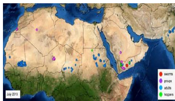
Areas showing some locust activities, FAO DLIS 8/2013:

The Desert Locust situation was calm in the region during July except in Yemen where one swarm reached Wadi Hadhramaut area in the interior. Breeding during June and July caused locust numbers to increase in Yemen, where solitarious and transient hoppers and adults were present. Control operations were not possible due to insecurity. Locust infestations declined in the spring breeding areas of Saudi Arabia where only a few adult groups were reported. Scattered adults persisted in the Nile Valley in northern Sudan and low numbers of solitarious adults appeared in parts of the summer breeding area but vegetation was slow to become green due to intermittent rains. In northern Somalia there was an unconfirmed report of hoppers. No locusts were reported elsewhere in the region.