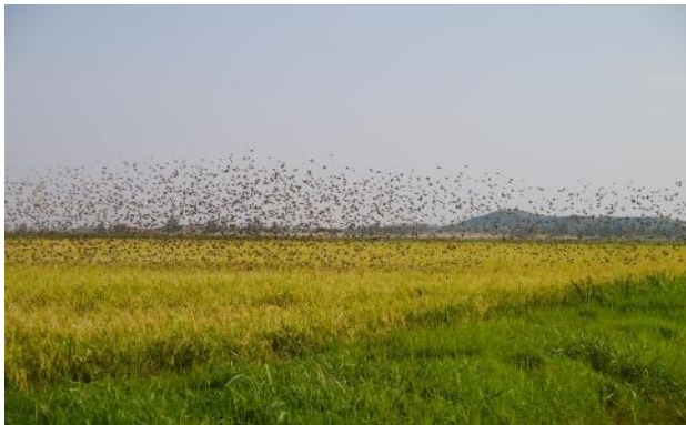
Massive flocks of quelea birds at Kibimba before aerial control

In recent years, Uganda reported an upsurge in the populations of quelea birds necessitating urgent lethal control. During a study done in Uganda by Ndege et al, in June, 2013, it was established that Tilda rice scheme alone, was recording 30-50% crop losses due to quelea. It was estimated that the quelea bird population was about 2 million causing over 1.5 tons of Rice crop loss per day. In late June, 2013, it was further reported in Uganda press that strange birds had wiped out over 1,000 acres of sorghum in Kapchorwa region. The Desert Locust Control Organization for Eastern Africa (DLCO-EA) in collaboration with the Crop Protection Department of the Ministry of Agriculture in Uganda visited Kapchorwa and confirmed that the birds were quelea. But there was no control done since the birds had already done total damage to the sorghum crop and left the area!