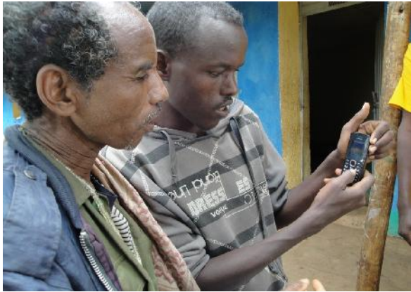
A Development Agent and a Community Forecaster reporting armyworm outbreak alerts through SMS in a village in Fedis District

The SMS Mobile Application was field tested in five villages in Fedis district in eastern Ethiopia. The items that need to be simplified or modified for use by the community forecasters were identified and communicated to the System Developer. Based on the feedback, the form had been simplified and user interface was added with the local language, Oromia.