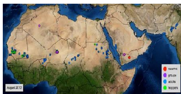
Areas showing some locust activities, FAO-DLIS 9/2013

The Desert locust situation remained generally calm in the region during August. Only low numbers of solitary adults were reported in the northern and eastern parts of the summer breeding areas in Sudan. Unusually good rains that fell during August allowed small-scale breeding to occur in September. Consequently, locust numbers increased and vegetation started to dry out, causing locusts to concentrate and form small groups in October. In Yemen, hopper and adult groups and at least one small swarm were reported in the interior as a result of local breeding. The situation is worrisome because breeding continued and small hopper bands and swarms formed.