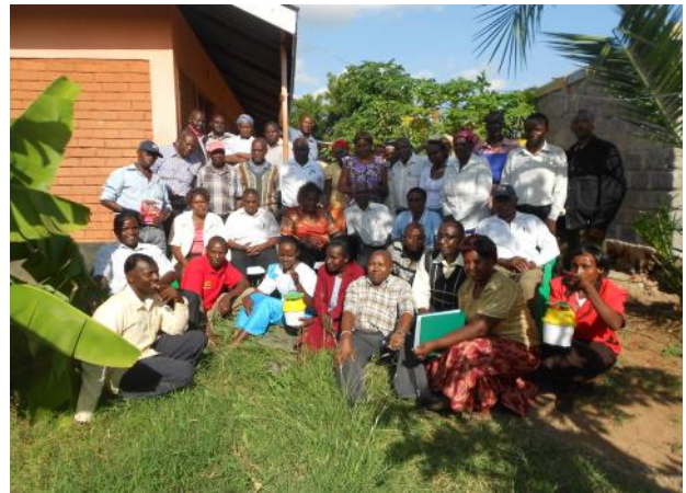
Group photo of participants in Kenya