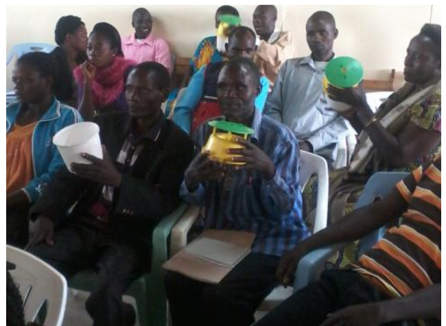
Participants in Mbeya rural district, Tanzania attending the class presentation