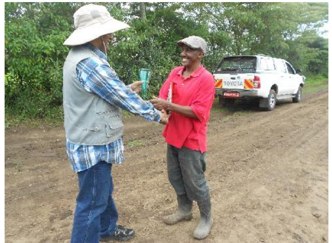
Technical Back up and Monitoring in Naivasha District , Kenya Community Forecaster explaining how to use the rain gauge