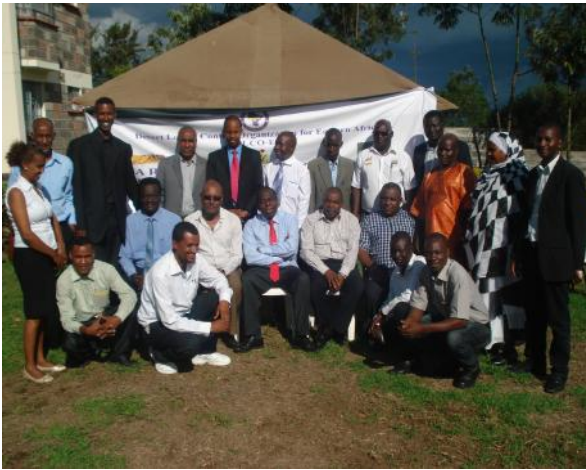
Group Photo of Participants, Nakuru, Kenya