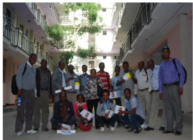
Group photo of participants Wukro, Ethiopia