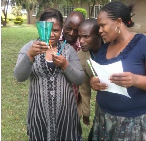
Trainer showing trainees how to read the rain gauge