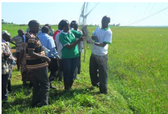
Participants are collecting trapped quelea specimens from mist net