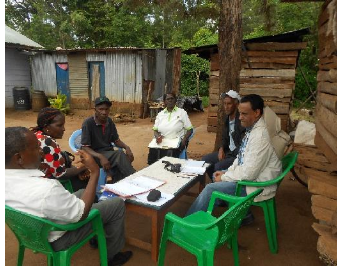
The Team interviews Armyworm Forecasters in a trap sites in Muranga South District Kenya